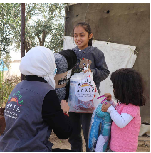
Nothing warms our partner org, NuDay Syria, taken during a